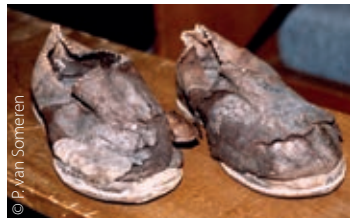
Peter Canisius' shoes in Nijmegen, Netherlands

Peter Canisius' lack of prominence might be due to the fact that the 16th century is largely associated with the great Reformers (Luther, Calvin, ...), making us forget that he was one of the key figures in the revival of the Catholic Church north of the Alps. At the time of his death in 1597, this was very different. Throughout his extraordinary life, he had almost become a sort of "catholic celebrity". While studying law, he came in contact with the newly-founded Jesuit order (1540) and felt the calling to join. On his 22nd birthday on 8 May 1543, he took his vows, making him a member of an order striving to go out into the world and help shape it. He dedicated his entire life to this Jesuit calling. In 1549, he went north to be part of the renewal of the Catholic Church in the German-speaking world that had drawn