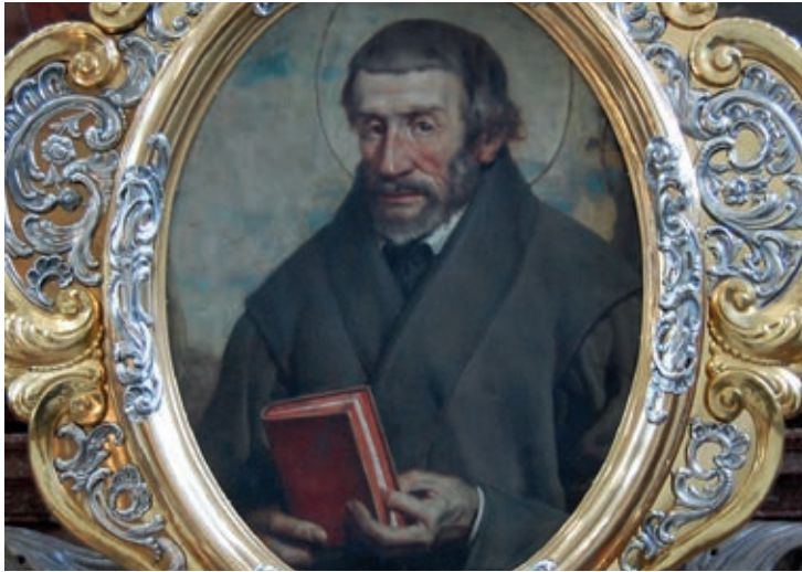
Peter Canisius altar in the Jesuit Church Innsbruck

Be honest: How much do you know about Saint Peter Canisius? Did you know that it is largely owed to him that in the 16th century, the Catholic Church in the German-speaking world didn't perish altogether? Or that he was in contact with pretty much all of the great leaders of his time, such as popes, emperors, kings and scholars? Or that his catechism is probably the most successful catholic book, at least of the last 500 years (1.200 editions so far)? Even in Innsbruck, it is a little-known fact that Peter Canisius' has been patron saint of the diocese for more than fifty years.